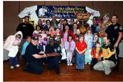
▶ Members from the Alaska Correctional Officers Association pose with Kid Safe attendees

The annual Kid Safe event was held Feb. 17 at Centennial Hall. Coordinated by Bartlett Regional Hospital, the event brought together more than 30 organizations that provided safety tips and demonstrations for children and their parents.